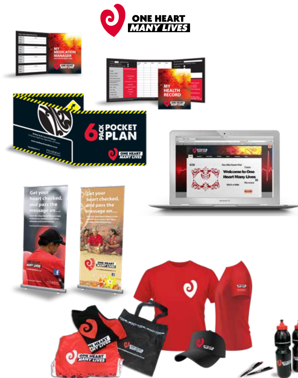
Examples of how to use the One Heart Many Lives branding

Please consider the One Heart Many Lives kaupapa when wearing branded clothing.