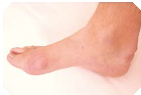
Ko e fufua kamata he gagao gout

Ko e gahua fakalataha haau, magafaoa haau, mo e ekekafo haau ke kaumahala ai e gagao gout.