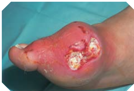
Ko e kili motumotu kamata he gagao gout